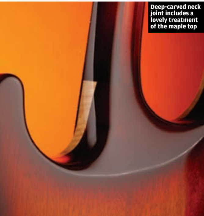
Deep-carved neck joint includes a lovely treatment of the maple top