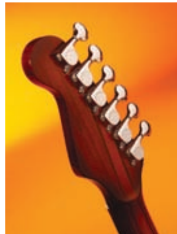
The neck is made from laminated lengths of mahogany and walnut. Posh Gotoh 510 tuners seal the deal

Plenty of finger room and a medium low action results in big, clean chords that ring out with purpose and authority