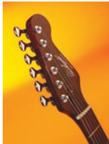
Williams uses a lightly kicked-back headstock – very elegant, and it does away with the need for string trees

This guitar, the newest in the Williams stable, goes under the name of the Set Neck Carved Top Deluxe. Opening the Hiscox case reveals an attractive, solid Brazilian mahogany body topped with a sumptuously flamed, bookmatched carved maple top. The smoky tobacco